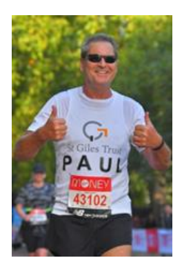
Running the London Marathon