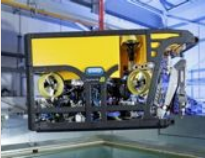
Photo: Work class tow fish (acoustic), rated to the depth of 4,000m, damaged during operations

Since their introduction in the 1970's ROVs have steadily replaced hazardous underwater diving operations, often in remote locations. In recent years the transition to fully diverless subsea operations in the offshore sector has seen deep water oil and gas reserves being primarily serviced by ROVs.