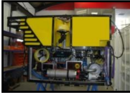
Remote Operating Vehicle

The Marine Practice continues to be successfully involved with the handling of losses occurring worldwide with a number of assignments involving ROV's, towed-arrays and oceanographic equipment. We have seen damage to equipment that has included contact and thruster type incidents.